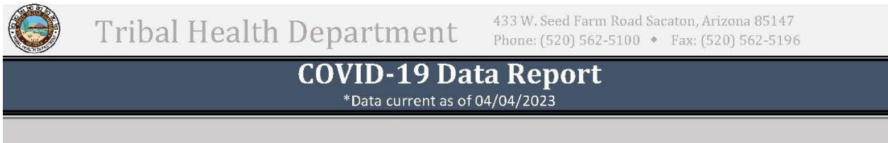
Figure C. COVID-19 Data Report